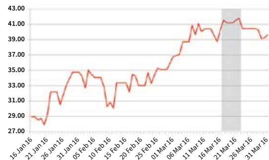
Figure 3. Oil price over Q1

is likely to be at or close to an end. There are therefore improving prospects that the bottom of the market has been reached, and a modest recovery underway, towards the USD 50 level that many forecasters see as the new equilibrium price.