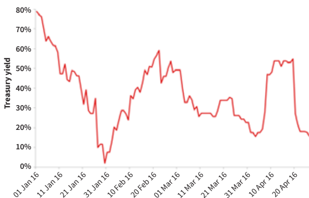
Figure 2. Expected probability of a Fed hike in July, over the year to date.

Returns in US dollars unless otherwise stated. May 2016.