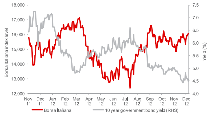
Figure 3: Italian equities and government bond yields post Berlusconi’s resignation

Mario Monti; since then (and with the help of the ECB) Italian government bond yields have fallen by 3.1% and the stock market has rallied by 7.2%. At the same time, unemployment remains stubbornly above 9.2%, whilst GDP is still 5.7% below its end of 2007 peak.